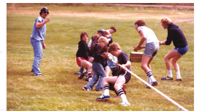
Color Wars 1980

Following a summer without camp due to global pandemic, we thought it would be nice to share some photos from past summers in the valley to remember the long-rooted history of Tohkomeupog, as we look forward to a bright future of many more summers in the valley to come!