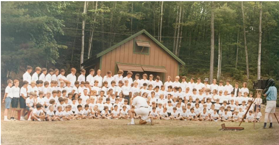
Camp Photo 1971