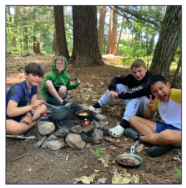
Above: Deer Clan on trip at Spruce Point. Below: Deer Clan on trip atop Mt. Crawford.